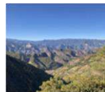
CHINA – Liming: agroforestry gardens with trees and medicinal plants