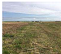
France – Beauce: Agroforestry on arable land