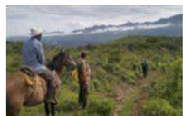
Mexico – restoring the tropical forest in the Selva el Ocote reserve and introducing silvopastoral system