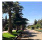
Lebanon – Restoring ecosystems and supporting local communities in Hammana and Anjar