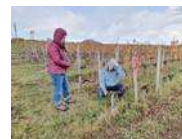
France – Gironde: Tree planting amidst vineyards in Saint-Emilion