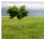
Togo – Lake TOGO: agroforestry, forestry and market gardening in 10 villages on the shores of Lake Togo