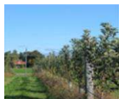
CANADA – Ontario: planting trees to restore ecosystems 2021